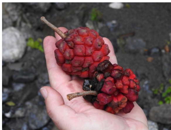
River crossing to get into the valley (top). Helwingia chinensis (left) and Kadsura coccinea (right)