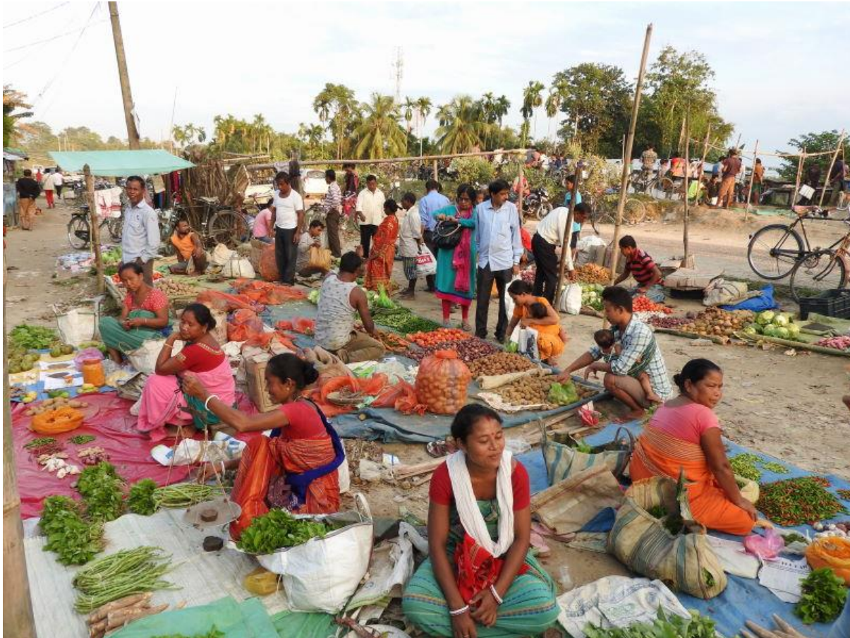
Shopping for groceries at the roadside market

in the day, it began to mist which turned into a steady rain. Our plan was to stay in Ziro for the night, but with the heavy rain approaching and the possibility of another major landslide which would leave us stuck in Ziro until it was safe to pass through. My schedule was tight on this trip, so we decided to make the long drive back to Itanagar at night, in the rain and just below a very unstable pass. We made it back to Oken's house late that night and completely exhausted.