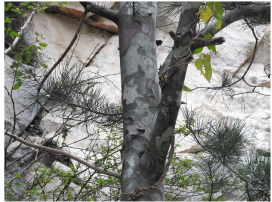
Pinus bungeana grove growing on limestone cliff face (left) and peeling bark of young seedling (right)