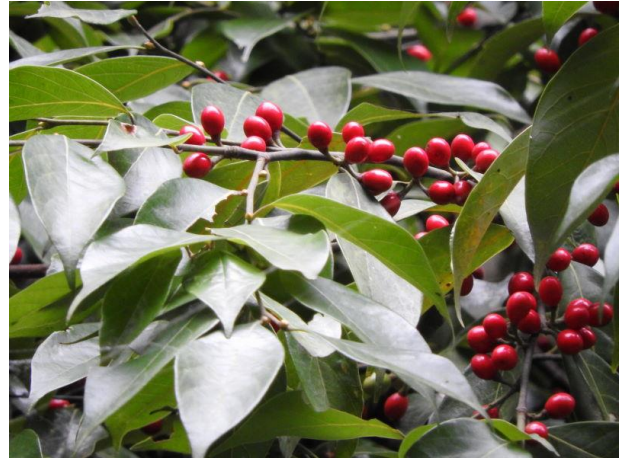
Cornus quenqinervis (left) and Lindera sp. (right)

The next morning we hit the road early. Once we began to make our ascent into the mountains, interesting plants began popping up all along the road...we had finally paid our dues on this trip it seemed. Right away we began to see nice clumps of Iris clinging to the sides of cliffs which prompted us to stop the car to get a closer look at the roadside vegetation. Not only did we find the Iris in seed, but we also saw Epimedium, Polygonatum, many species of ferns, an unusual black fruited Cornus, an exceptionally showy species of red fruited Lindera and that was only in the first hour or so. Deciding that we needed to move a little faster if we were ever going to actually get to the mountains, we all reluctantly climbed back into the car and pressed on. As we slowly began winding our way up and deeper into the mountains, the forest began to transition into a mostly deciduous one and the air became markedly cooler.