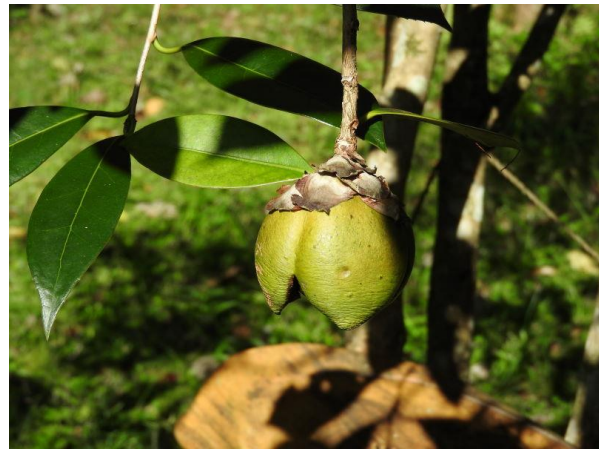
Torreya jackii (left) and Camellia sp. (right) with enormous fruit