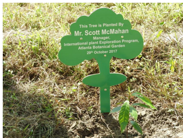
Tree planting ceremony in Assam, India

After the tree planting, it was time to leave Wild Masheer and continue on towards Ziro. Spending a few days at the tea plantation made me forget just how far away we were from any major city...but not for long. We needed food for our trip, so the first thing we did was stop off at a local “farmer’s market” along the road. The people, colors and smells of these markets are full of life and hard to forget. Since there is very little refrigeration there, these markets are commonplace and the local villagers depend on them for their daily needs. Wandering around these kinds of markets, you will always find things that make your mouth water both from hunger and nausea. The freshest fruits, vegetables, spices and meats are available for next to nothing, but you can also find delicacies like huge land snails pulled from their shells while you wait and bundles of dried “very old” rats to flavor your soup.