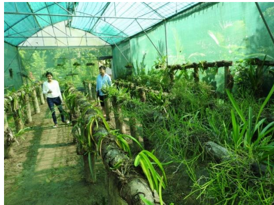
Tea garden at the Balipara Foundation (top) with main house, nursery (left) and orchid house (right)