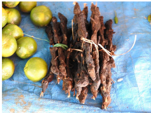
Everything is paid for by weight (right), even the bundles of "very old rats" (left)