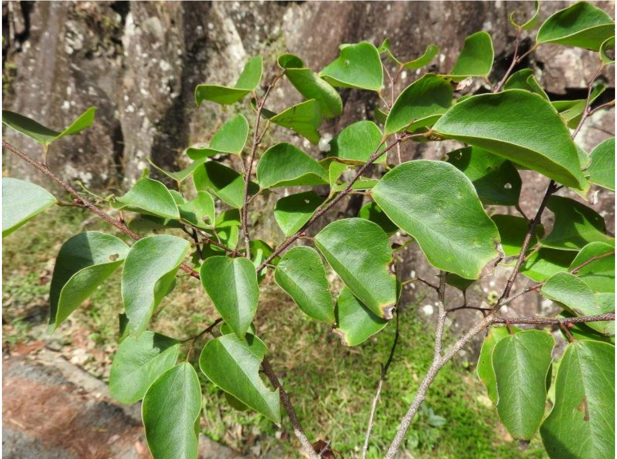
Cercis aff. chuniana with very leathery foliage on a 20' tree

colleauge's phone rang. It was the cranky cop with NOTHING else to do but harrass us and he wanted to know why we hadn't passed the check point yet?? Busted again. So we quickly squeezed back into our cars and off we went...but not before collecting seed of a very interesting Cercis, possilbly C. chuniana.