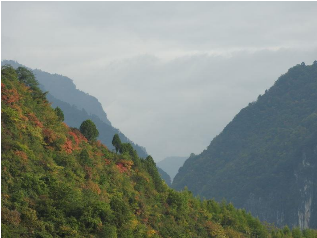
View from above our hotel (top) and entrance to the valley we were to explore (bottom)