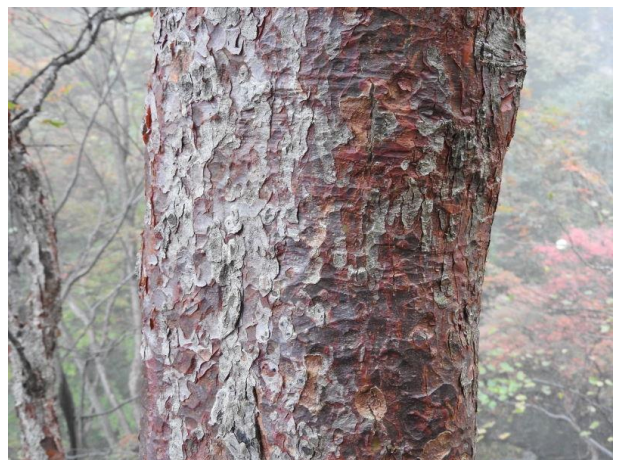
Acer griseum forest in the Qinling Mountains