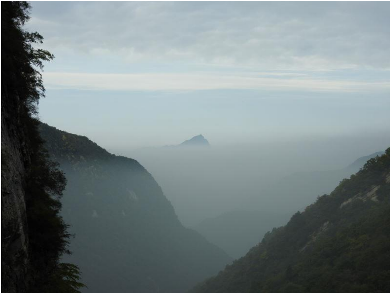
The northern side of the Qinling Mountains

side, this area was the easiest for us to access first. Some of the plants we were seeing on the northern side included enormous specimens of Cercis glabra (80' +) as well as a second species of Cercis , Sorbus , Aralia , Epimedium , Polygonatum , Paris , Viburnum , Syringa , Tilia and even Acer griseum . Seeing Acer griseum in the wild is always a thrill and to come upon a small forest of them like we did was not only unexpected, but certainly one of the highlights of the trip. Just as we began to climb out of the valley into the beautiful fall color of the Maples, the clouds parted briefly allowing us to catch a glimpse of the many peaks in the distance.