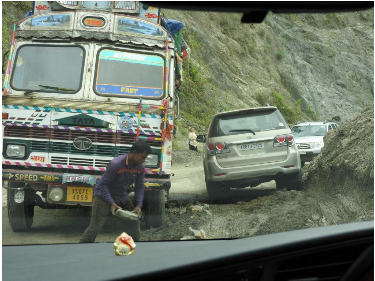
Making our way through the landside