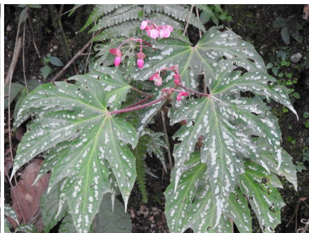
Unknown Begonia species from the hills around Ziro