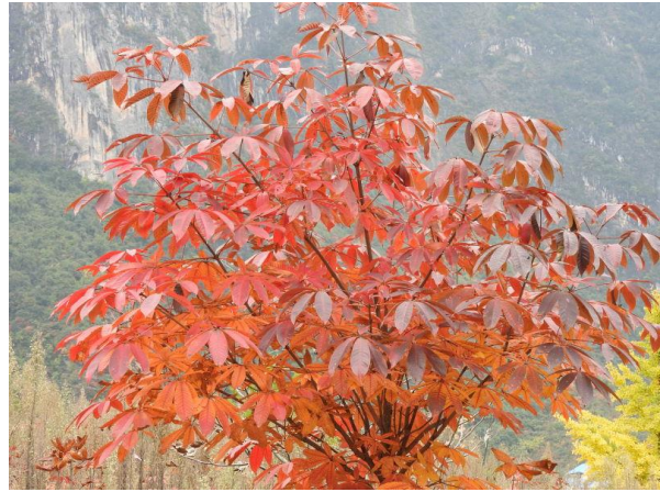
Lindera sp. with large foliage and amazing white undersides (left). Aesculus chinensis fall color (right)