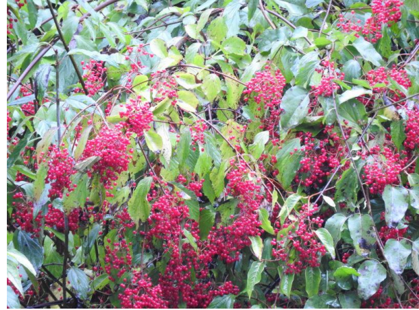
Paris sp. (left) and Viburnum aff. betulifolium in fruit(right)