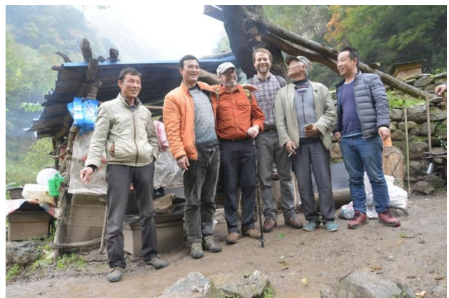
One of the taller Cypripediums we found (left) and our newfound beekeeper friends (right)

After spending much of the day hiking into the valley, we decided to go on a bit longer, have a snack and hike out. Not 10 minutes after making that decision, we came upon a leanto shack with smoke billowing out of the chimney. Soon after, several guys stumbled out to see what their dogs were barking at. Turns out they were a group of beekeepers that lived back in the valley for 6 months out of the year in