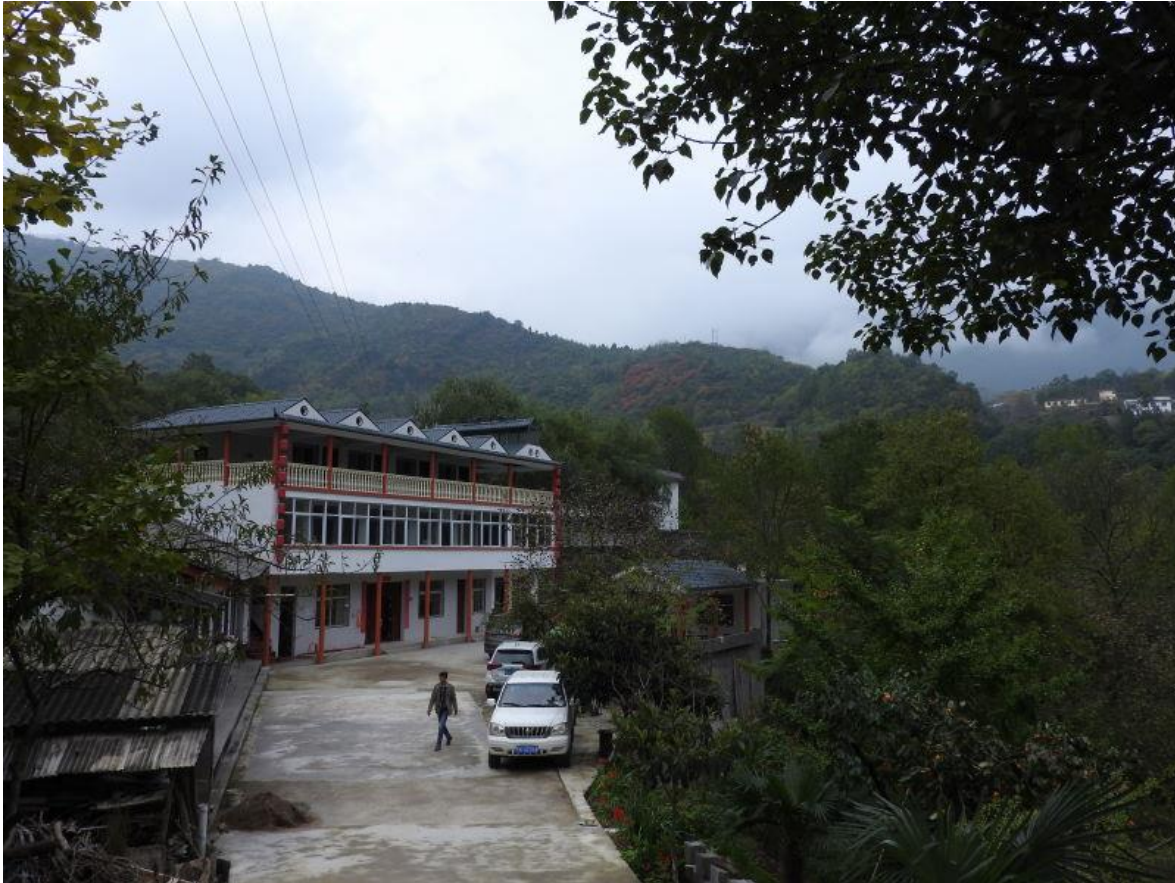
Qinling accomodations. Restaurant / family living quarters on 1 st floor with 5 guest rooms on the 2 nd

The next day we all woke up early once again, very eager to get into the valley. In discussing the plan for the day with our guide, Donglin learned that the only way into the valley would be for us to follow the river which we would have to cross a couple of times. “Not a problem”, we told our guide and off we went. After about a 30 minute hike through agricultural fields we hit a dirt road that led into the valley. Walking along this road we were already seeing fantastic plants that were just setting the stage for what was to come. We began to see things like red fruited Helwingia chinensis , Aesculus , Acers , Clematis , huge fruited Kadsura coccinea , Linderas with enormous white backed foliage, Cercis racemosa and even several species of Cypripedium . What we didn’t notice was that while we were walking, the valley became more narrow, the river seemed higher and the limestone cliffs that were just in the distance early this morning were now jutting up out of the ground all around us.