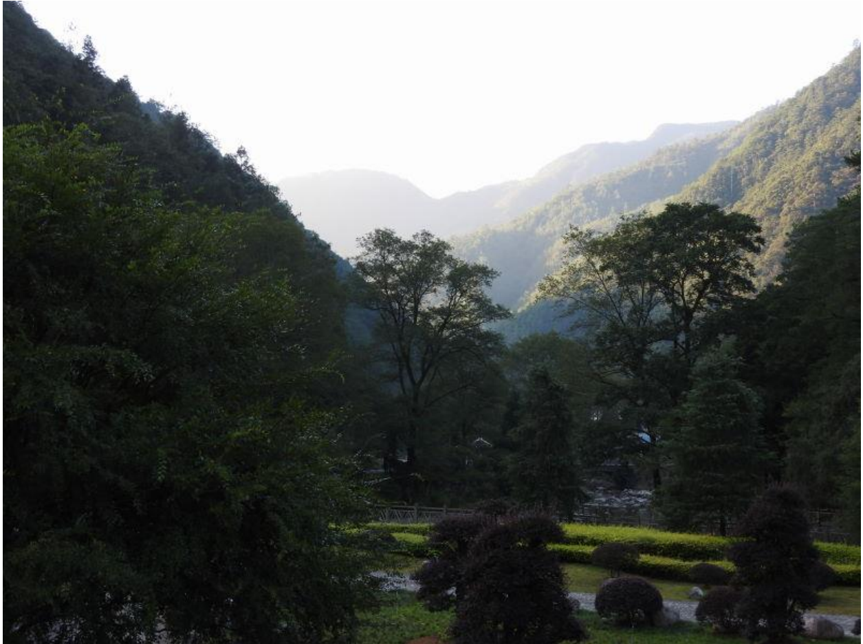
View from the hotel in the Wuyi Mountains